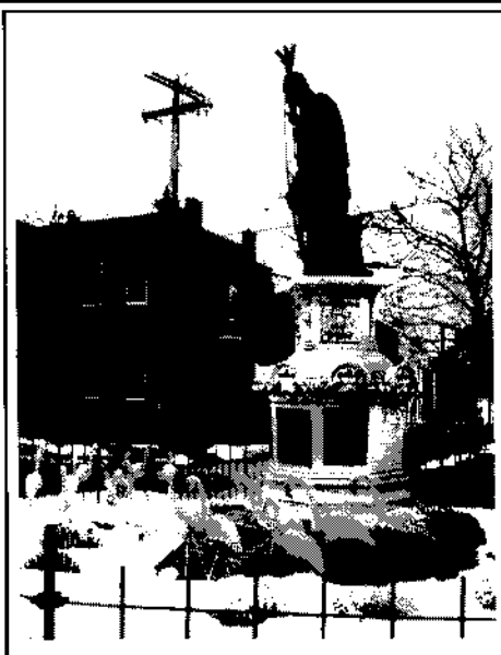
Mysterious flamingos surrounded Lawrence on Valentine's Day!