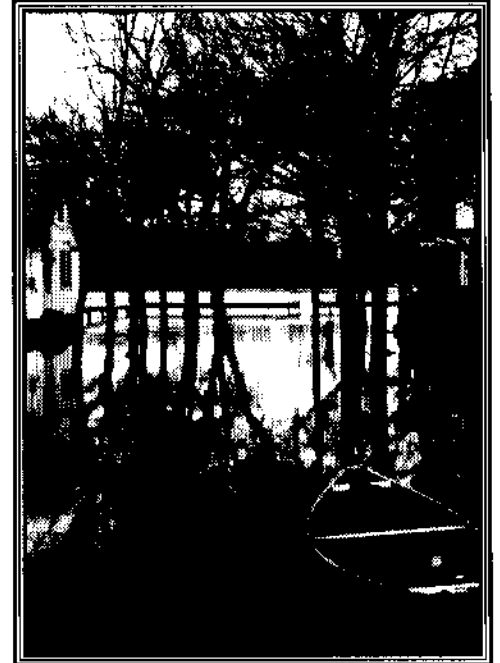
End of Ingersoll Avenue