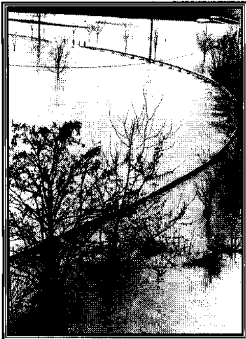
The road on Van Slyke's Island to the Community College and bike path.