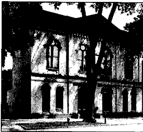
Former Historical Society building on Union St., next to The Stockade Inn.

Eggs were 14 cents a dozen; sugar 4 cents a pound; coffee 15 cents a pound; 8% of the homes had a telephone; 14% had bathtubs with most women only washing their hair once a month; maximum speed limit was 10 mph; average wage was 22 cents an hour; and the average life expectancy was only 47 years old! The year was 1904, the scene when the Schenectady County Historical Society was just beginning.