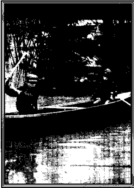
The Flood of 1987