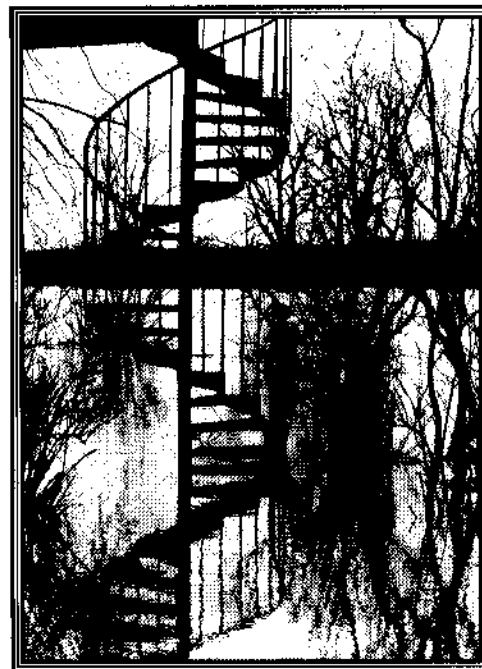
Stairway at the end of Cucumber Alley