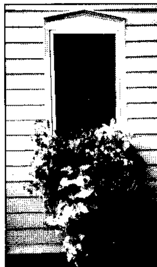
3 Front Street