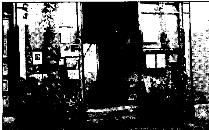
Moon and River Cafe South Ferry Street