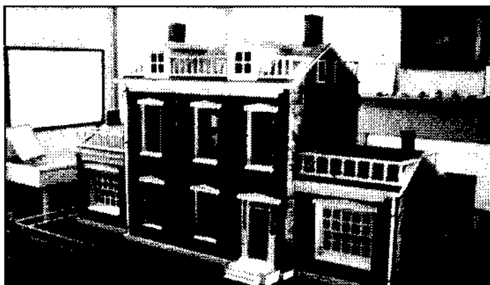
1834 Yates Doll House

This holiday season, start a new tradition, or continue one, with the child (or child at heart) in your life by visiting The Schenectady County Historical Society. Enjoy the new exhibit, "Childhood Remembered" throughout the month of December. You can see antique dolls from several eras, the 1834 Yates doll house, a quaint child's carriage from the Ellis family, and many toys from the collection.