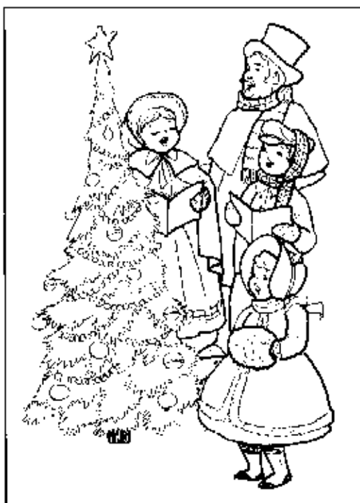
sketch from the December 1969 Spy Does anyone know who the artist is?

outstanding display of handmade creations at the Van Dyck by area artists include wreaths, pottery, candles, jewelry designs, knitwear, stained glass, wood designs and much more.