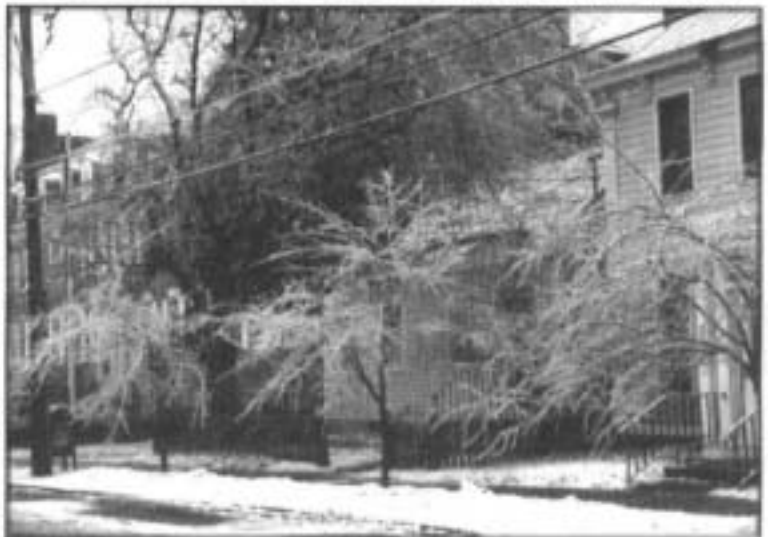
Ice Blossoms on Wash. Ave. Dec. Storm

Family & Child Service urges the public to join in this effort by bringing non-perishable food items of all kinds to 246 Union Street (across from the Van Dyck), throughout the month of February, Monday - Friday, between the hours of 8 am - 4 pm. Donations will be distributed to needy clients in the FCSS Medicaid Services Coordination program, which serves families with a developmentally disabled child or youth; to low-income seniors through the B'nai B'rith (continued on page 2)